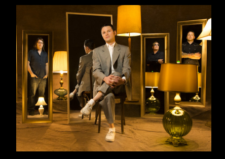
START MAK ING SENSE SEPTEMBER 10, 2021