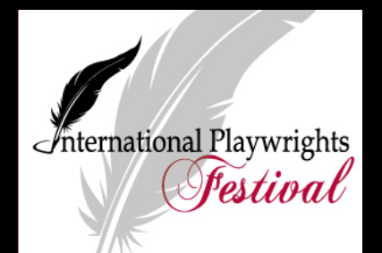
INTERNATIONAL PLAY WRIGHTS FESTIVAL OCTOBER 15-17, 2021