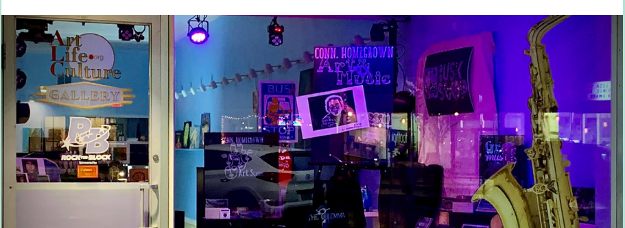
11 am - 9 pm: Live Music Performances (see pg. 15 for details)