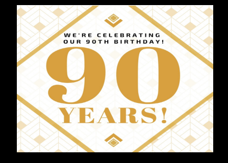
90TH BIRTHDAY CELEBRATION AUGUST 28, 2021