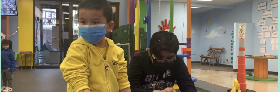
10 AM - 4 pm: Open for Play