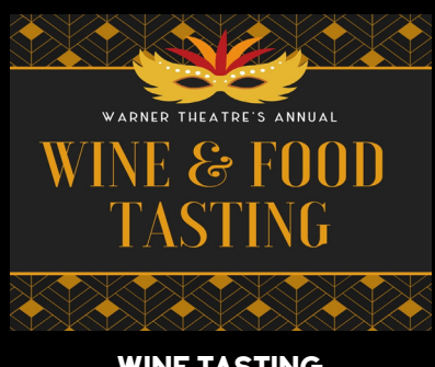
WINE TASTING OCTOBER 22, 2021