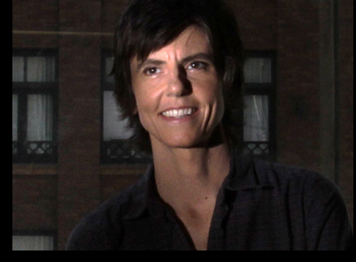
TIG NOTARO JANUARY 22, 2022