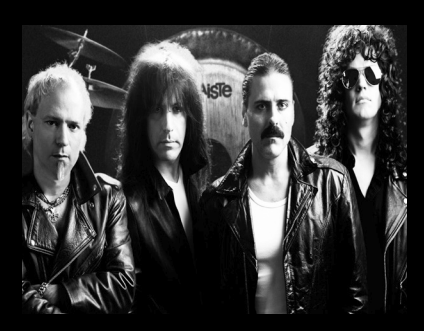
ALMOST QUEEN OCTOBER 2, 2021