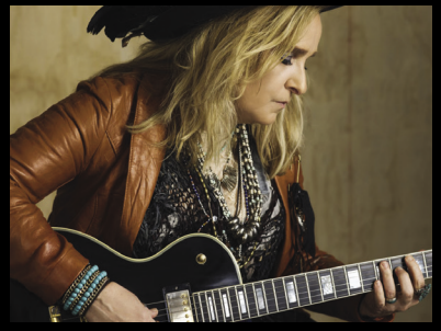
MELISSA ETHERIDGE NOVEMBER 2, 2021