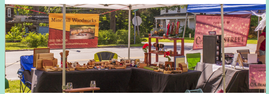
11 am - 4 pm: Local Art Fair (see pg. 10 for details)